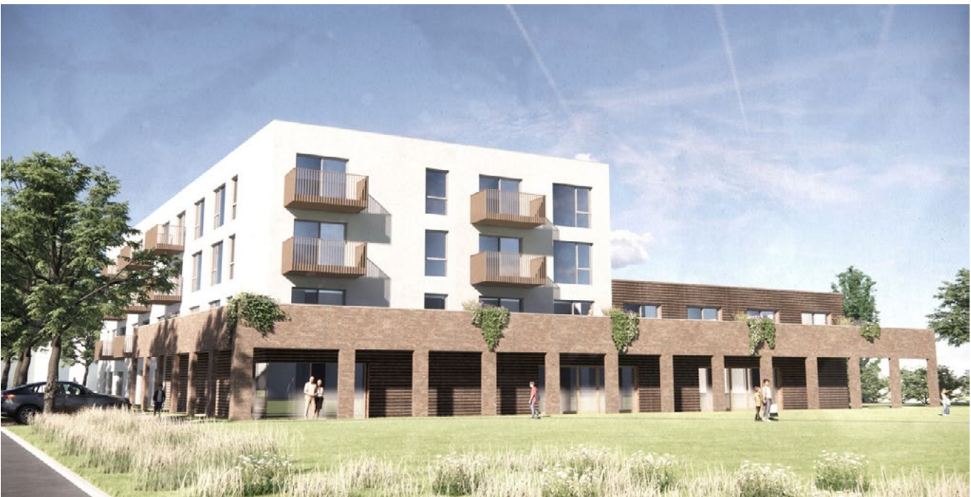
CGI representation of New Fossey Road.