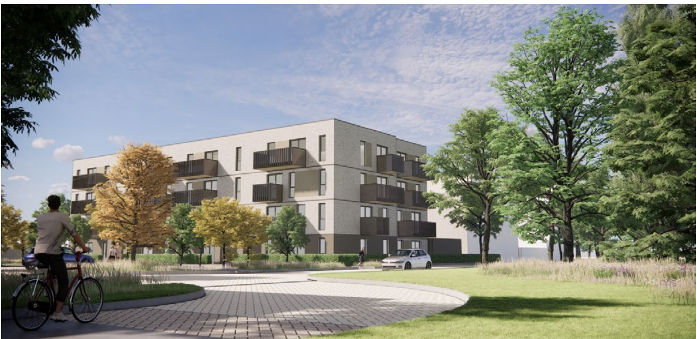
CGI representation of one part of the Dovercourt Road development.